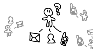
Figure 1 Deciding which channel to use requires consideration as to what is available and also what is preferable given the context.

Also important, as mentioned explicitly by a few participants, is whether a medium is available between different people. For example, if a group member wishes to contact their entire group, including fringe members, a complete set of contact details might not be available to them. Two participants described the scenario whereby they had mobile phone numbers and email addresses for some people, but for others only email. As a result of this they felt limited when trying to send a bulk message to their group (Figure 1).