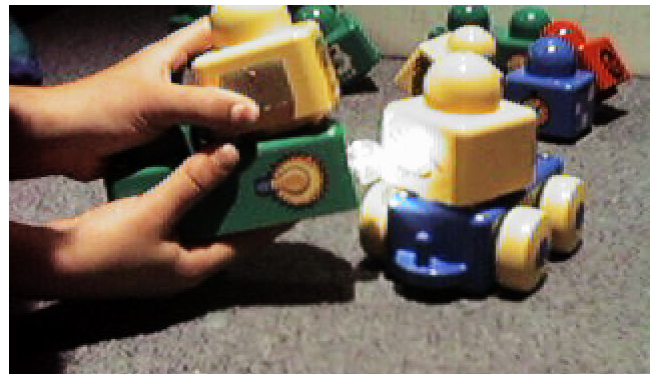
Figure 3: A remote control car demonstrates interaction between block stacks. The touch block on the light block forms the remote control for the car formed by placing a seeing block on a movement block.