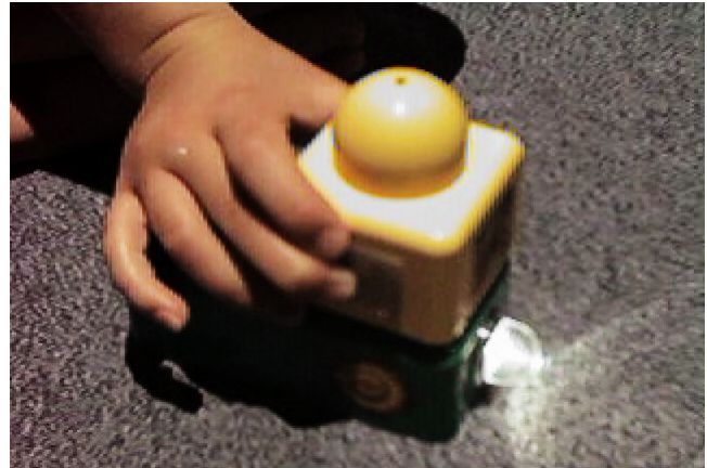
Figure 2: A touch block attached to a light block will cause the light to turn on whenever sensor plate is touched.

The addition of logic blocks to the set of Electronic Blocks opens up a wide variety of additional construction opportunities. In scenario 2, the not block provides Andrew with the capability to build a structure that only produces an action if a particular stimulus is not received. In Andrew's interactions with the Electronic Blocks, he worked out how to use a logic block to make his car construction more manageable.